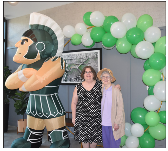
July 18 was the perfect day for a rooftop picnic, courtesy of Newman Lofts and the MSURA. About 60 people enjoyed hot dogs, baked beans and other fun food along with a "frost your own cookie" opportunity and a raffle for some hand-crafted towels. Attendees could also tour an apartment in the building. Sparty and a balloon sculpture greeted folks when they entered the building.